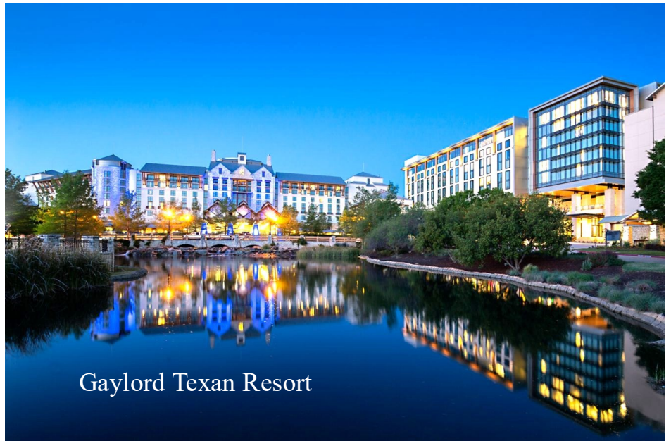
Gaylord Texan Resort

In reporting the results of the election, the candidates shall be placed on the roster in the order of votes received. The number of delegates to which the state is entitled shall be declared regular delegates; the remaining candidates shall be declared alternates.