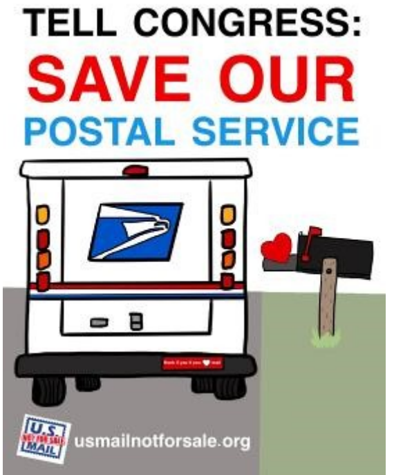
Poster by Mary Matthews. You can download and use this image from <a href="https://labornotes.org/saveourpostalservice">https://labornotes.org/saveourpostalservice</a>

Help save YOUR job and the jobs of over 600,000 of our Postal brothers and sisters. Contact your Senator.